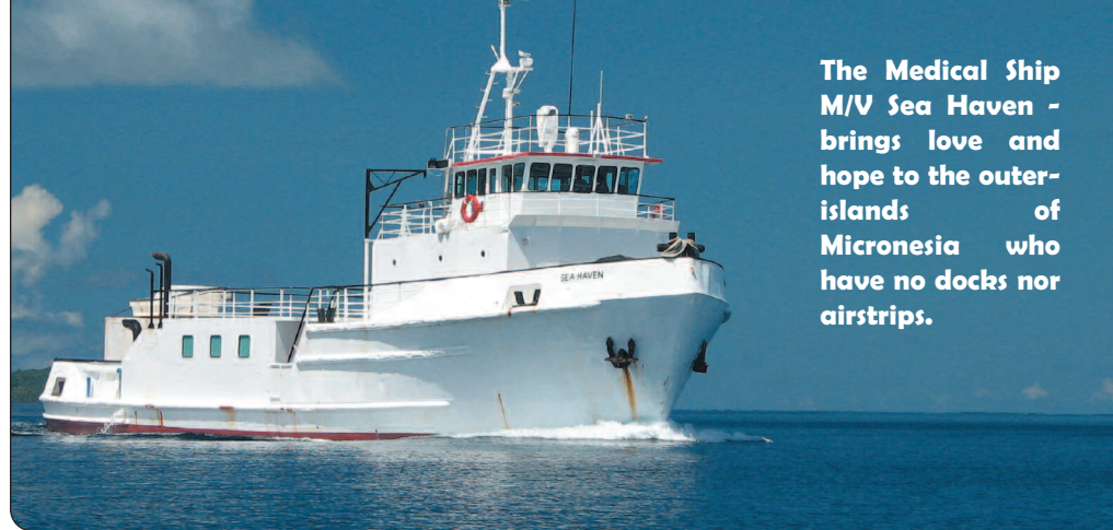
The Medical Ship M/V Sea Haven - brings love and hope to the outer-islands of Micronesia who have no docks nor airstrips.