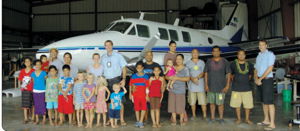
Our Yap Team is serving with commitment as unto the Lord - in Aviation and PMF church ministries.