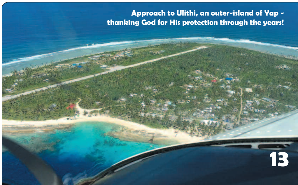
Approach to Ulithi, an outer-island of Yap - thanking God for His protection through the years!