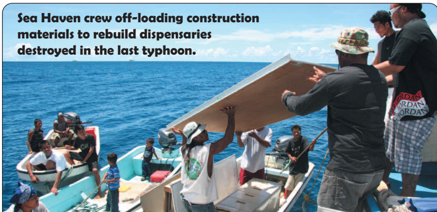
Sea Haven crew off-loading construction materials to rebuild dispensaries destroyed in the last typhoon.