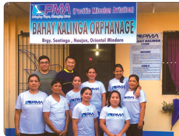
We are thankful for our Naujan, Mindoro Station with the Orphanage and a Surgi-Center, equipped to serve the community not only in Naujan but all over Mindoro and beyond, with the care of abandoned, neglected and abused children and cataract and other minor surgeries.