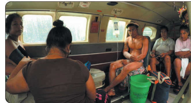
Thanking God for the ability to make a difference in the lives of our island people through emergency aviation services.

We always try to follow up with patients we have flown on medevacs by visiting them at the hospital. This is a great way of building relationships and sharing the love of Jesus on a more personal level. Being able to demonstrate God's love to the islands through this medevac service is truly an honor. Thank you for your prayers and support which make medevacs like this possible.