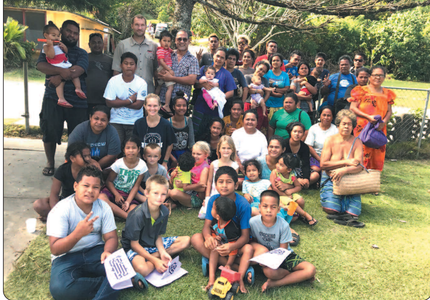
PMF Yap Church ministers to the outer-islanders in mainland Yap, as well as the outer-islands for Christ!