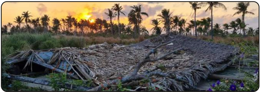
Church totally destroyed by Typhoon Ulysses