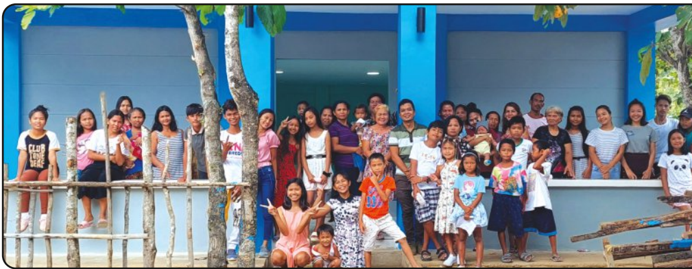
The PMF Apad congregation joyfully takes a photo in front of the newly built church!

Back to Patnanungan Bayan, our base which includes the PMF church ministries and the PMA Learning Academy. The following day, Sunday, was a great time of worship at our PMF Poblacion church, a fitting end to our trip. I praise and thank God for the opportunity to visit the islands and for His protection all throughout the trip. To Him be the glory!