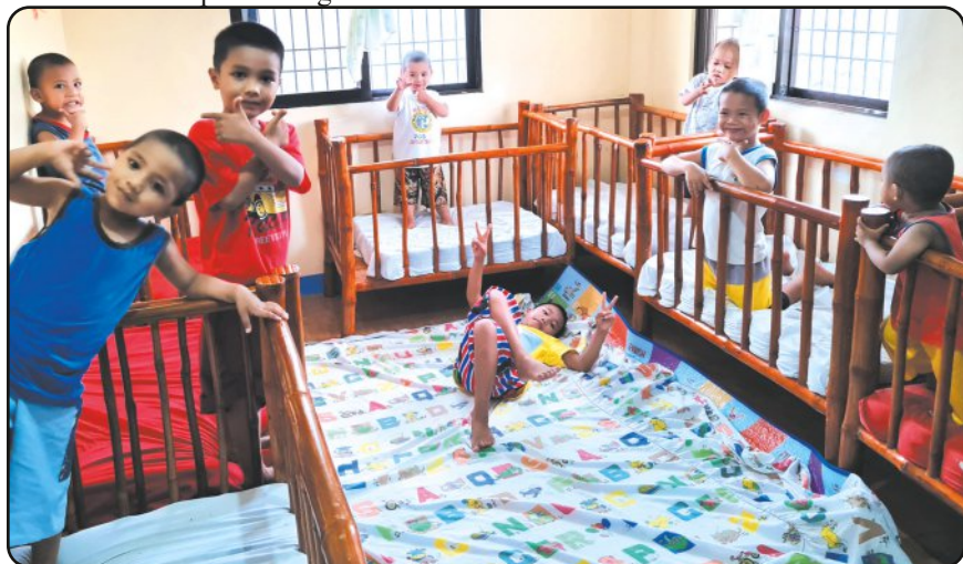
Our children are full of energy and still want to play... but it is nap time at the Bahay Kalinga Orphanage.