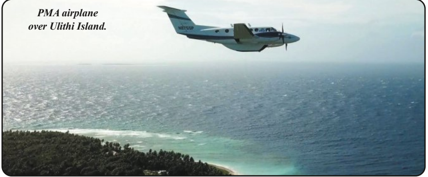
PMA airplane over Ulithi Island.

We had our Islander aircraft making metal with a damaged camshaft, one of our King Air’s propellers was greased with the wrong grease and requires two new props. Our Queen Air Engine overhaul requires the crankshaft and crankcase to be replaced, which almost doubles the cost of the overhaul. Our Cessna 206 nose landing gear overhaul required an unexpected part which also doubled the cost of that overhaul. We had to bring in a technician from Nashville to recertify our planes and the bill was depressing. We lost one of our line pilots during a recurrent flight check in February, and until we get him retrained to proficiency, we are quite shorthanded. And then aside from the PMA ministry, our personal family member had a tragic death in a car accident, and a friend our age died from cancer just last week.