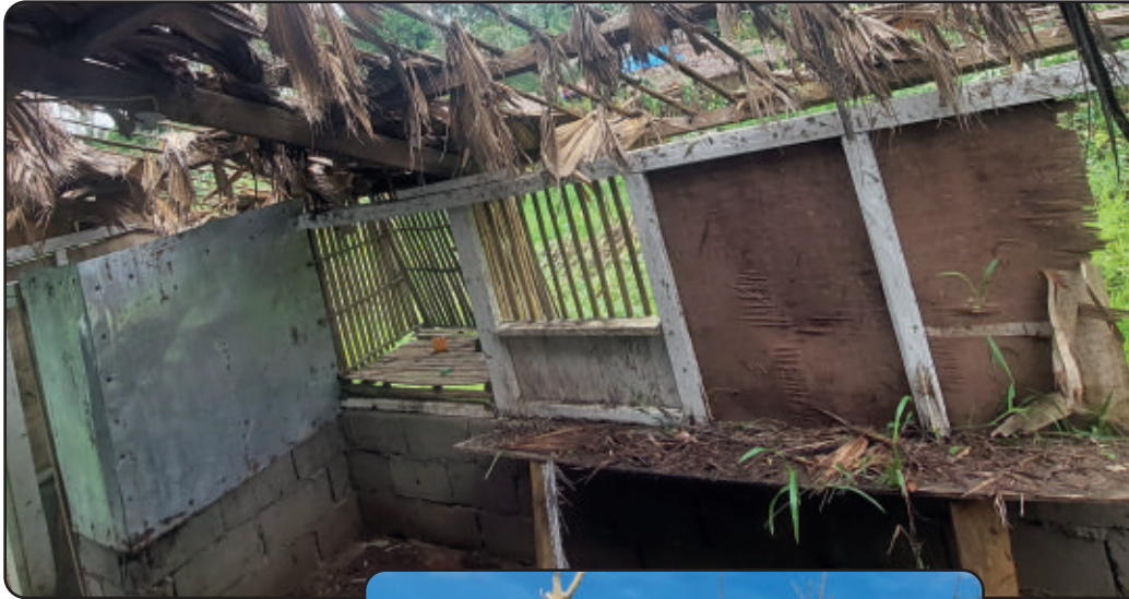
PMF Catmon church damages. As the rainy/typhoon season in upon us, we await for better weather to repair the damages in the church. Meanwhile home visitation is a must.

The one verse that keeps them going is “Therefore, my beloved brothers, be steadfast, immovable, always abounding in the work of the Lord, knowing that in the Lord your labor is not in vain.” 1 Corinthians 15:58