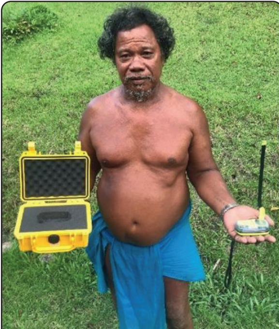
An Islander with a Personal Locator Beacon (PLB) provided by PMA – A great help when looking and rescuing people lost at sea.