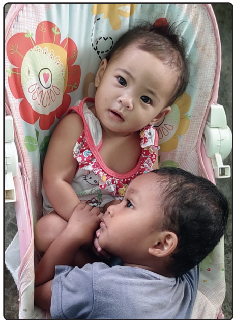
Children cared for and loved by our Bahay Kalinga staff show love for one another themselves.

God has truly provided for every need—often before we even knew what to ask for. Bahay Kalinga stands as a living testament to His compassion, provision, and the power of faithful obedience.