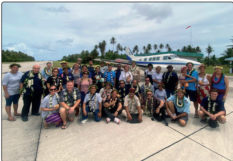
PMA Mission staff from Pohnpei, Yap, Palau, Guam and the Philippines gather for a remembrance photo on PMA's 50th Anniversary Celebration on the Island of Ulithi, Yap, Micronesia.

PMA's story is His story. To God be the glory!