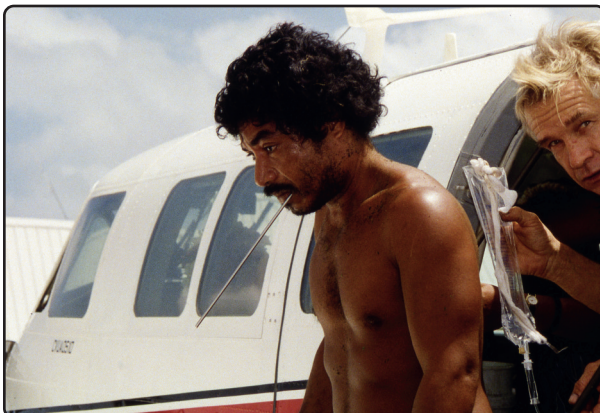
Spear fishing accident and the timely assistance of PMA.

To PMA, to the hands that lifted me, and to the God who never fails— my deepest thanks!”