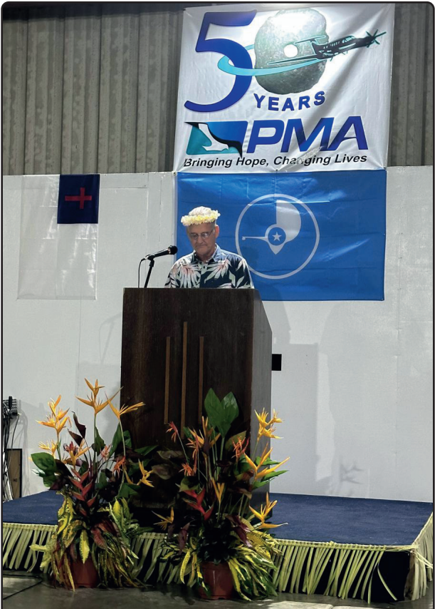
PMA's President/CEO thanking God and everyone during the 50 years anniversary!