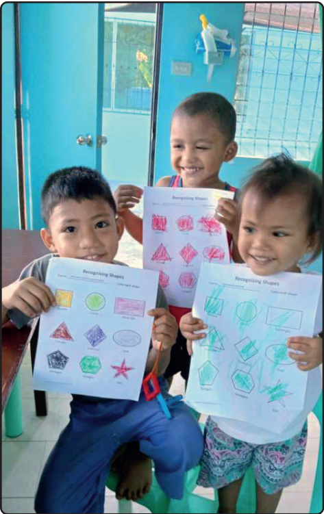
BK children happily display their art work proudly!