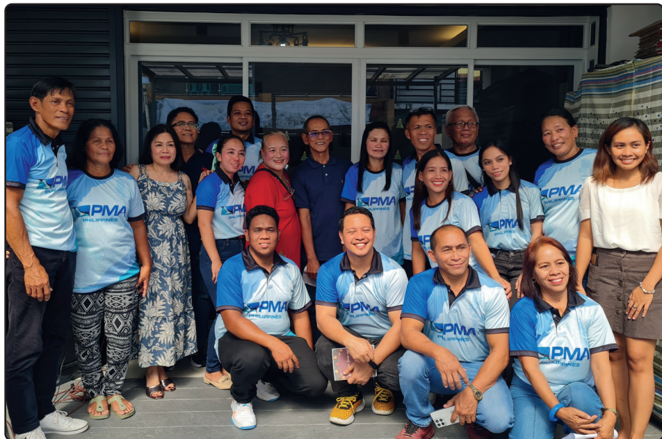
PMA Philippines mission staff celebrate the goodness and faithfulness of the Lord.

As PMA presses on with its mission—Loving all people, Building the Body of Christ, and Discipling the Faithful—we declare: To God be the glory!